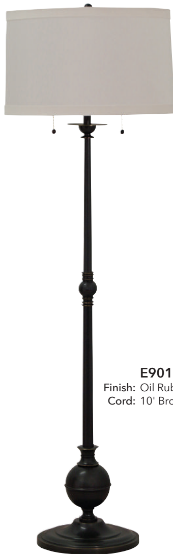
E901-OB Finish: Oil Rubbed Bronze Cord: 10' Brown