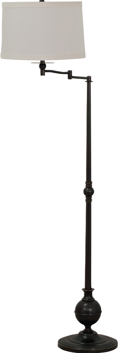
E904-OB Finish: Oil Rubbed Bronze Cord: 10' Brown