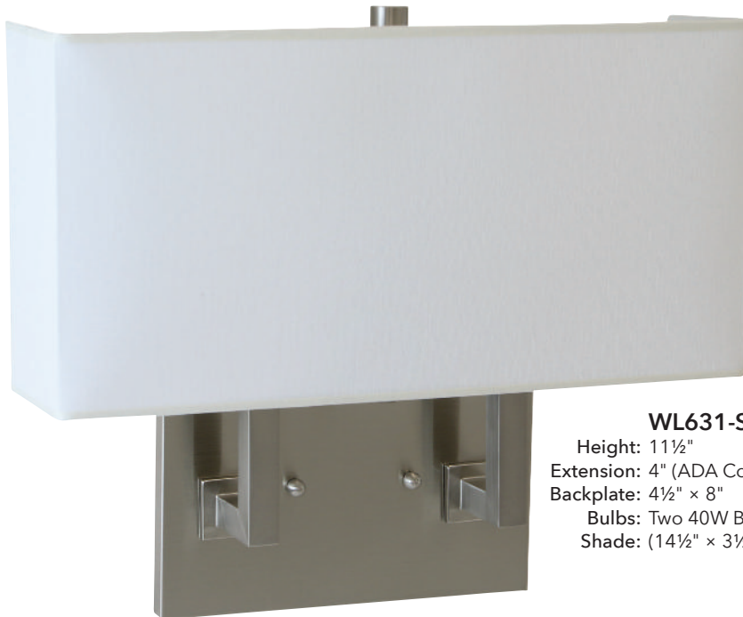
WL631-SN Height: 11½" Extension: 4" (ADA Compliant) Backplate: 4½" x 8" Bulbs: Two 40W B10 Shade: (14½" x 3½") x (14½" x 3½") x 7"