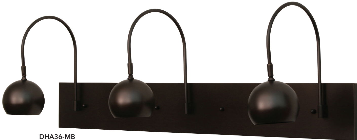
DHA36-MB Finish: Mahogany Bronze Backplate: 4 1/2" x 36"