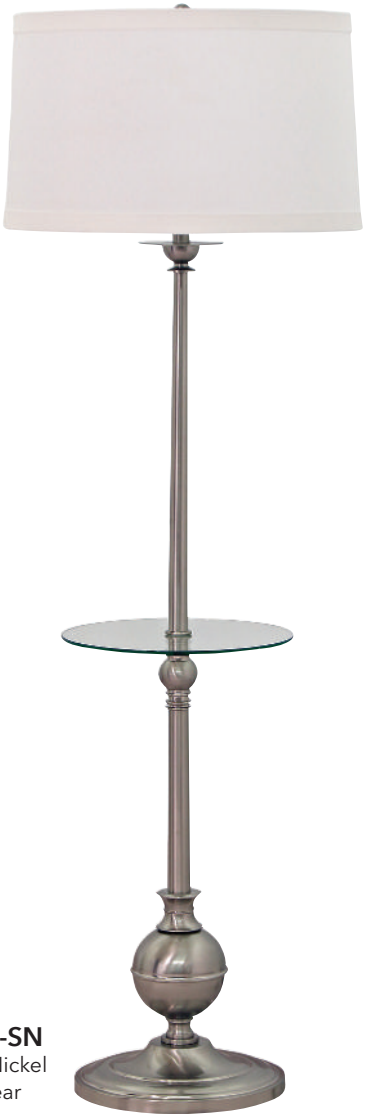
E902-SN Finish: Satin Nickel Cord: 10' Clear