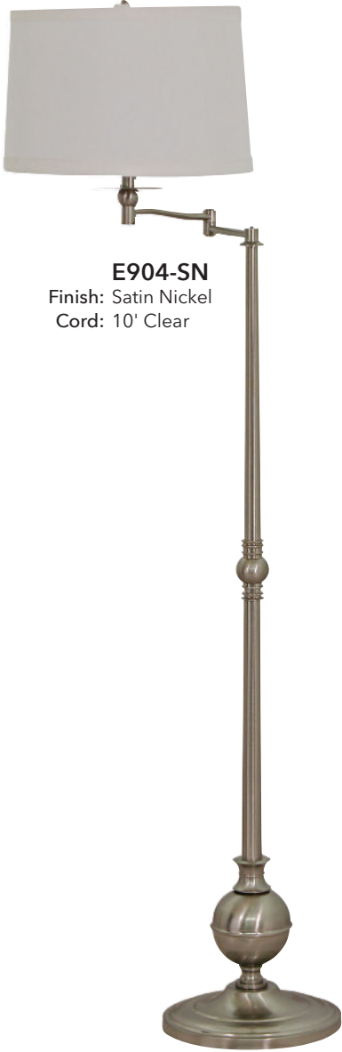
E904-SN Finish: Satin Nickel Cord: 10' Clear