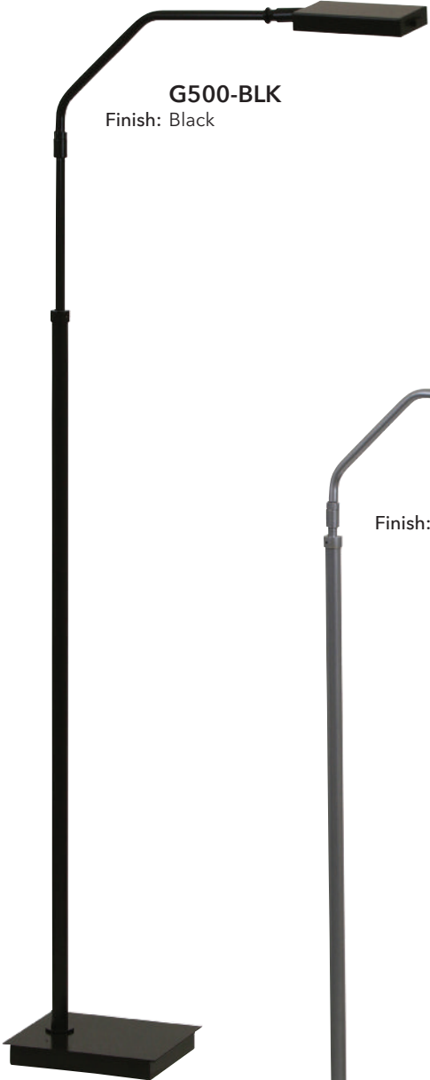
G500-BLK Finish: Black