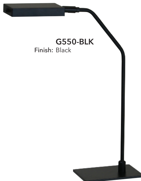
G550-BLK Finish: Black