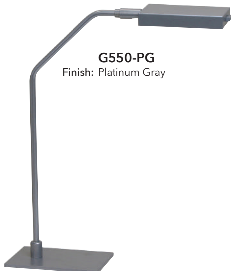
G550-PG Finish: Platinum Gray