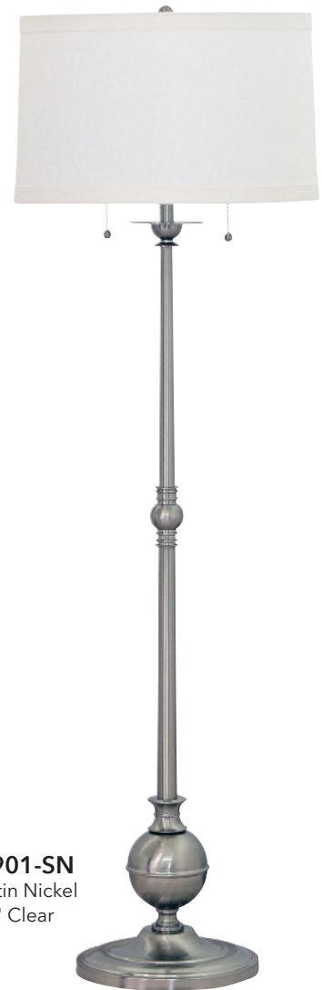
E901-SN Finish: Satin Nickel Cord: 10' Clear