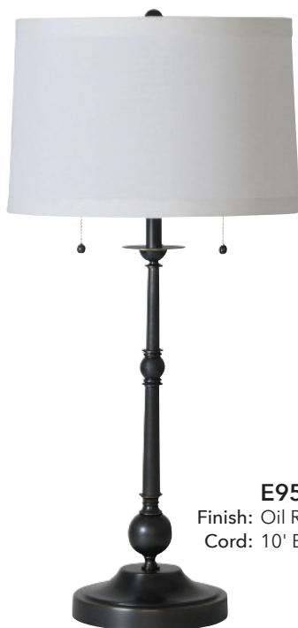
E951-OB Finish: Oil Rubbed Bronze Cord: 10' Brown