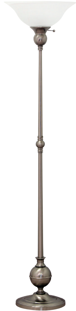
E900-SN Finish: Satin Nickel Cord: 10' Clear