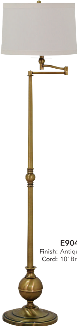
E904-AB Finish: Antique Brass Cord: 10' Brown

Height: 61" Extension: 23" Base: 10" Bulb: 150W 3-way Switch: On Socket Shade: Cream Linen Hardback 14" x 15" x 10"