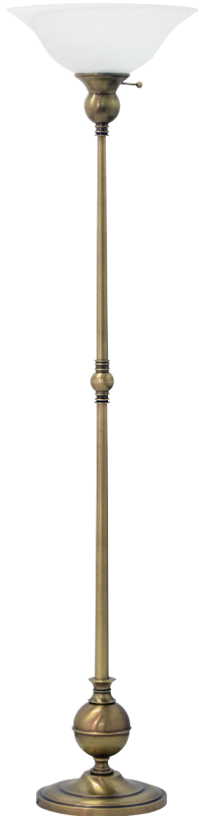
E900-AB Finish: Antique Brass Cord: 10' Brown

Height: 69" Base: 10" Bulb: 150W Type A Switch: On Column Shade: White Glass 15¾" x 6"