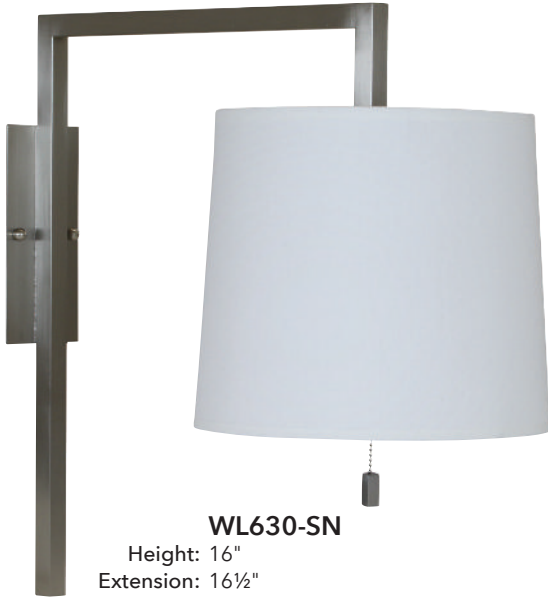
WL630-SN Height: 16" Extension: 16½" Backplate: 6" x 2¾" Bulb: 100W Type A Shade: 8" x 9" x 8"

WL630 is a pin up only. WL631/WL632 are Direct Wire only.