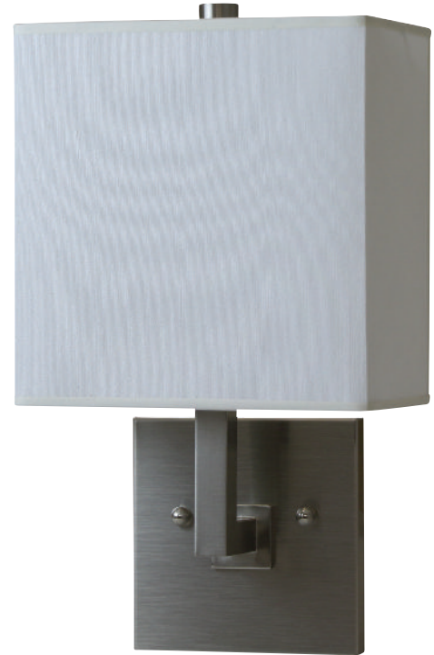
WL631-SN Height: 11½" Extension: 4" (ADA Compliant) Backplate: 4½" x 4½" Bulb: 40W B10 Shade: (7" x 3½") x (7" x 3½") x 7"