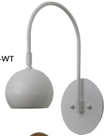
DHA05-WT Finish: White Backplate: 5"