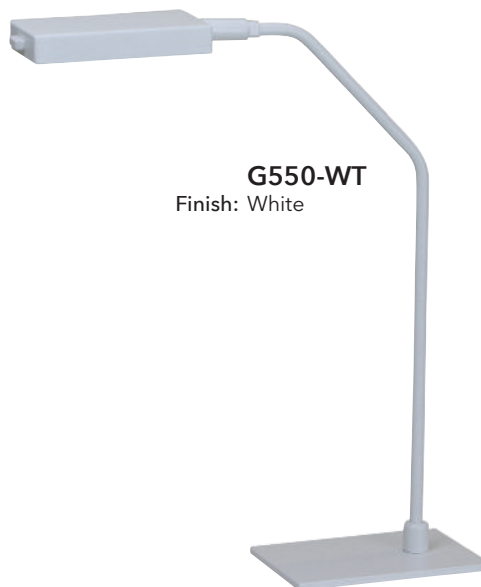
G550-WT Finish: White