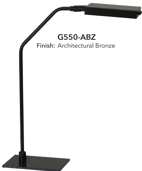
G550-ABZ Finish: Architectural Bronze