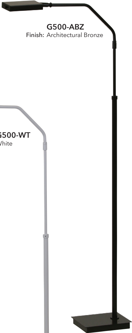
G500-ABZ Finish: Architectural Bronze