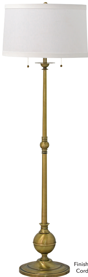
E901-AB Finish: Antique Brass Cord: 10' Brown

Height: 57" Base: 10" Bulbs: Two 100W Type A Switch: Pull Chain Shade: Cream Linen Hardback 17" x 18" x 11"