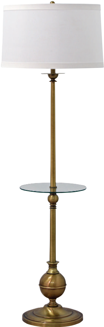
E902-AB Finish: Antique Brass Cord: 10' Brown

Height: 56" Base: 10" Bulb: 150W 3-way Switch: On Socket Shade: Cream Linen Hardback 17" x 18" x 11" Table: 12" diameter Table height 24"