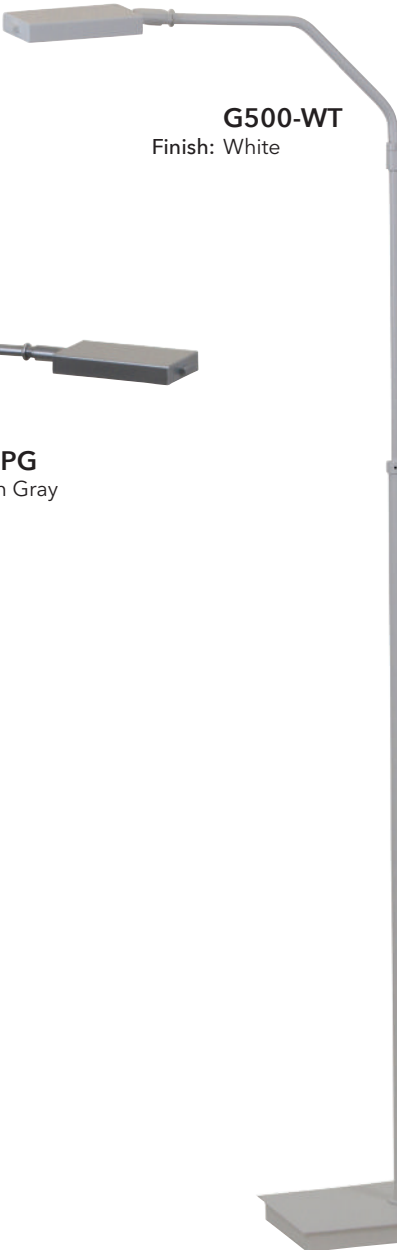
G500-WT Finish: White