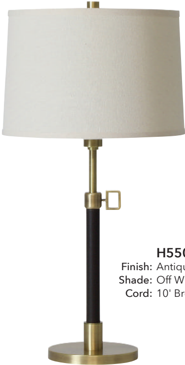
H550-AB Finish: Antique Brass with Brown Leather Shade: Off White Linen Hardback Cord: 10' Brown