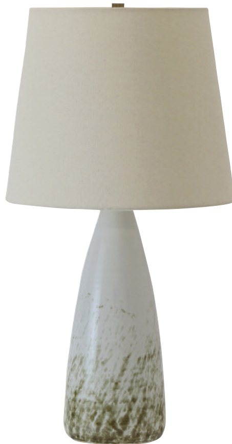
GS850-DWG Finish: Decorated White Gloss