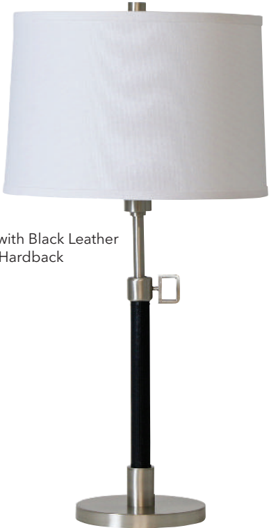
H550-SN Finish: Satin Nickel with Black Leather Shade: White Linen Hardback Cord: 10' Clear

Height: Adjusts 24" to 48" Base: 7" Bulb: 100W 3-way Switch: On Socket Shade: 13" x 14" x 9½"