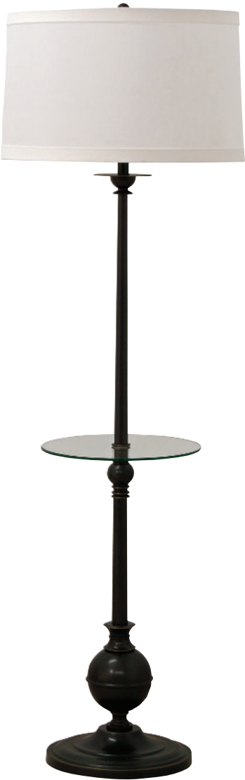
E902-OB Finish: Oil Rubbed Bronze Cord: 10' Brown