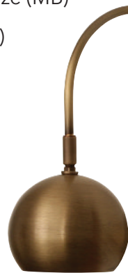
DHA24-AB Finish: Antique Brass Backplate: 4 1/2" x 24"