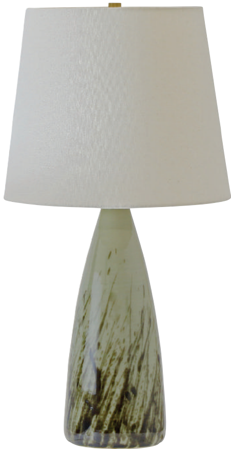
GS850-DCG Finish: Decorated Celadon

Height: 25½" Base: 6" Bulb: 100W 3-way Switch: On Socket Shade: Off White Linen Hardback 10" × 13" × 11" Cord: 10' Clear