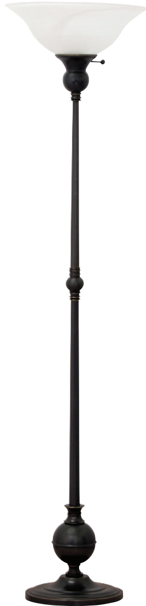
E900-OB Finish: Oil Rubbed Bronze Cord: 10' Brown